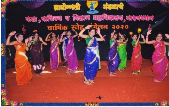
Group Dance: Lavani