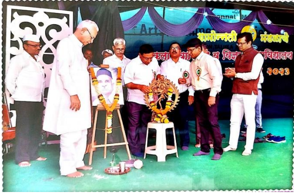
Inauguration of Cultural Programme