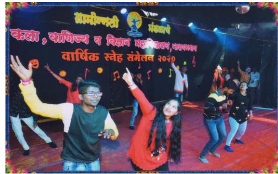
Group Theme Dance