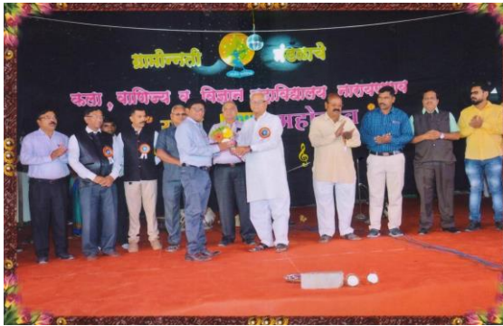
Inauguration of Cultural Programme