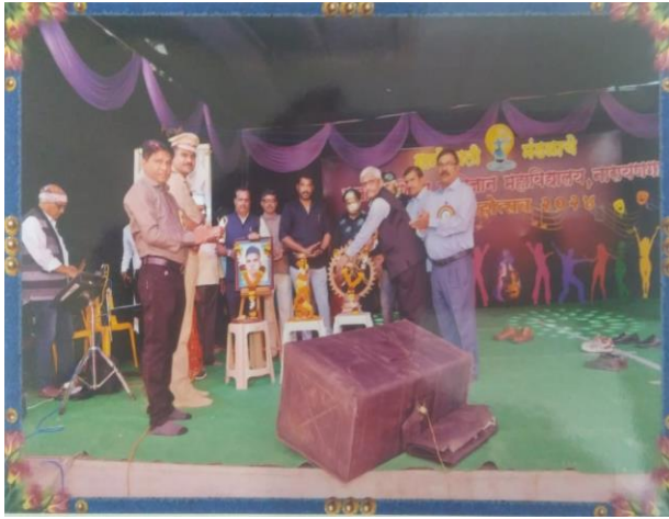
Inauguration of Cultural Programme