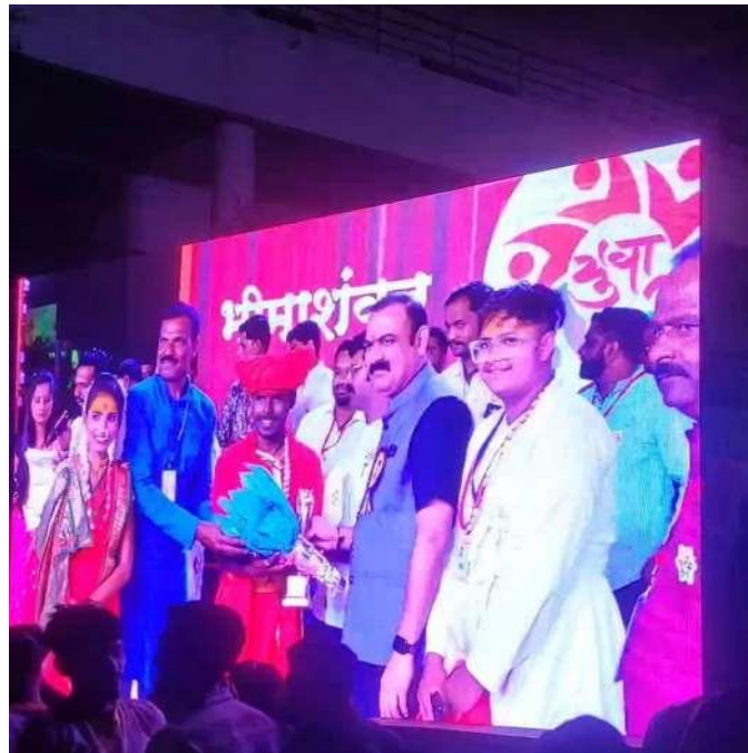
STATE LEVEL BHIMASHANKAR KARANDAK, MANCHAR (AAICHA GONDHAL) BEST COLLEGE IN DISCIPLINE- I RANK GROUP DANCE- III RANK