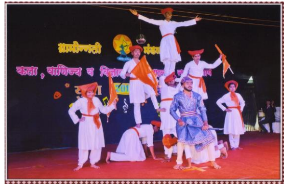
Drama on Chhatrapati Shivaji Maharaj