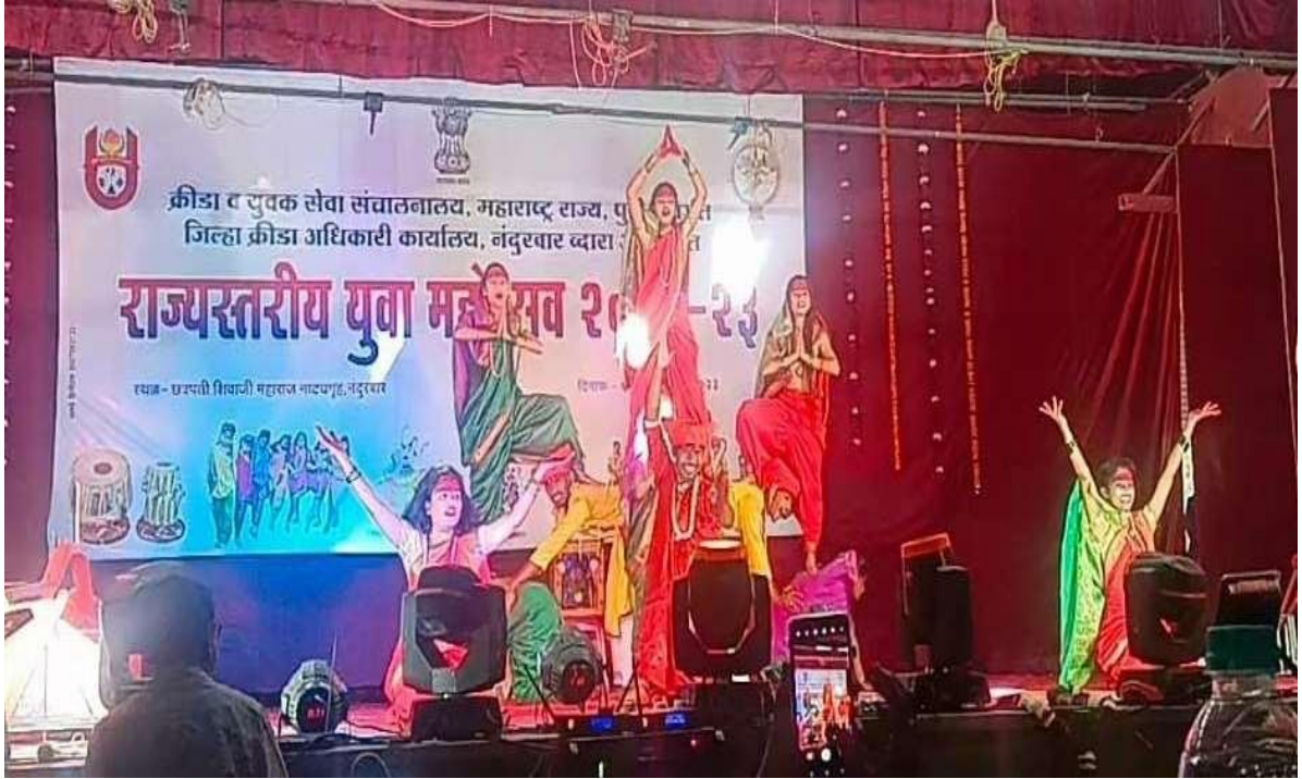
STATE LEVEL YOUTH FESTIVAL COMPETITION- 2023 ORGANIZED BY YOUTH & SPORTS DEPARTMENT, MAHARASHTRA STATE- GROUP DANCE- III RANK